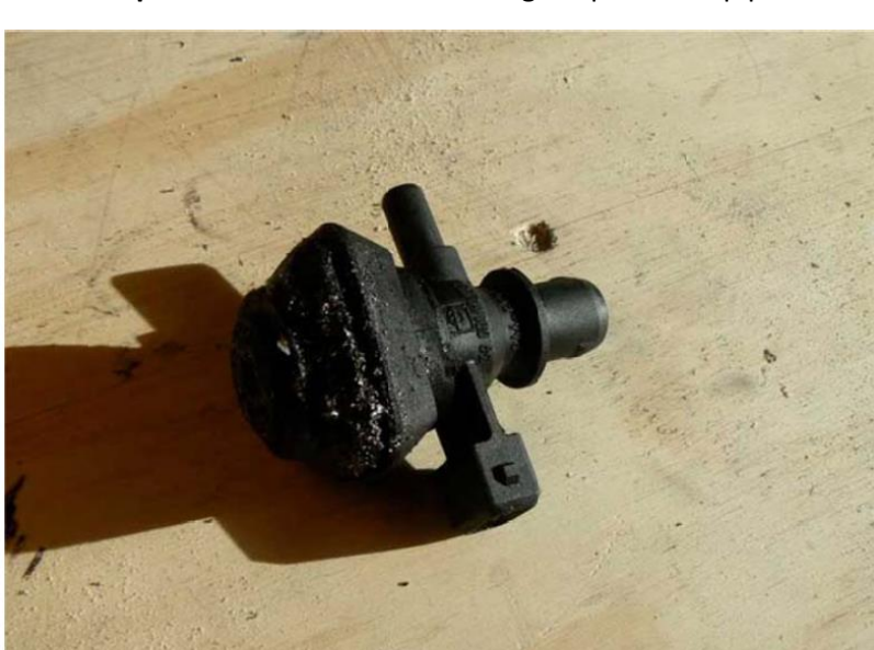
Step 1 : Remove PTC from the original plastic air pipe.

The following steps detail how to modify your original PTC (Positive Temperature Control) module so that you can reuse it with your Snabb Turbo Intake Pipe.